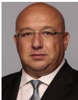
Krasen Kralev Minister of Youth and Sport