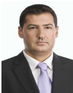
Ivan Totev Mayor of Plovdiv